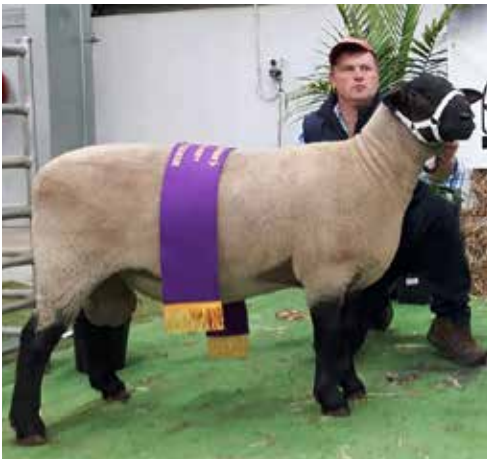
Suffolk Reserve Champion Ram - Sayla Park