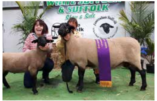
Suffolk Reserve Champion Ewe - Ridgell Downs