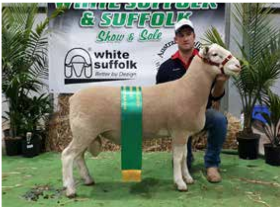
White Suffolk Junior Champion Ram - Baringa Studs