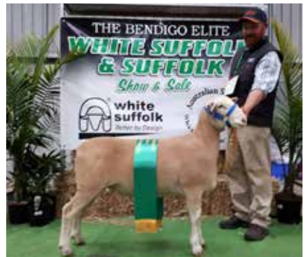
White Suffolk Junior Champion Ewe - Supreme White Suffolks