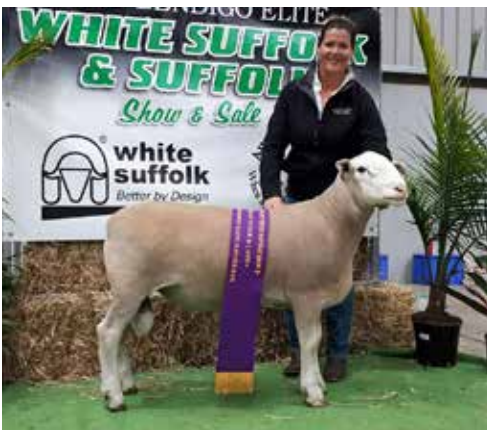
White Suffolk Reserve Senior Champion Ram - Ashley Park Stud