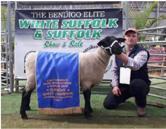
Supreme Exhibit & Suffolk Supreme Exhibit Ewe - Sayla Park Suffolks