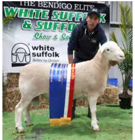
White Suffolk Supreme Exhibit and Senior & Grand Champion Ram - OMAD White Suffolk Stud