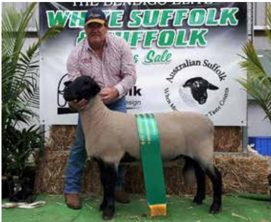
Suffolk Champion Ram - Ashley Park