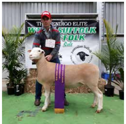
White Suffolk Reserve Senior Champion Ewe - Booloola White Suffolk Stud