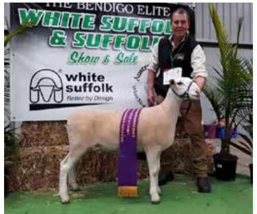
White Suffolk Reserve Junior Champion Ewe - Wattle Park White Suffolks