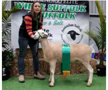
White Suffolk Senior Champion Ewe - Wattle Farm White Suffolks