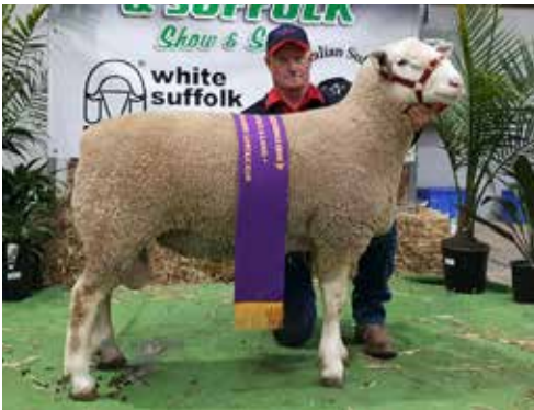
White Suffolk Reserve Junior Champion Ram - Baringa Studs