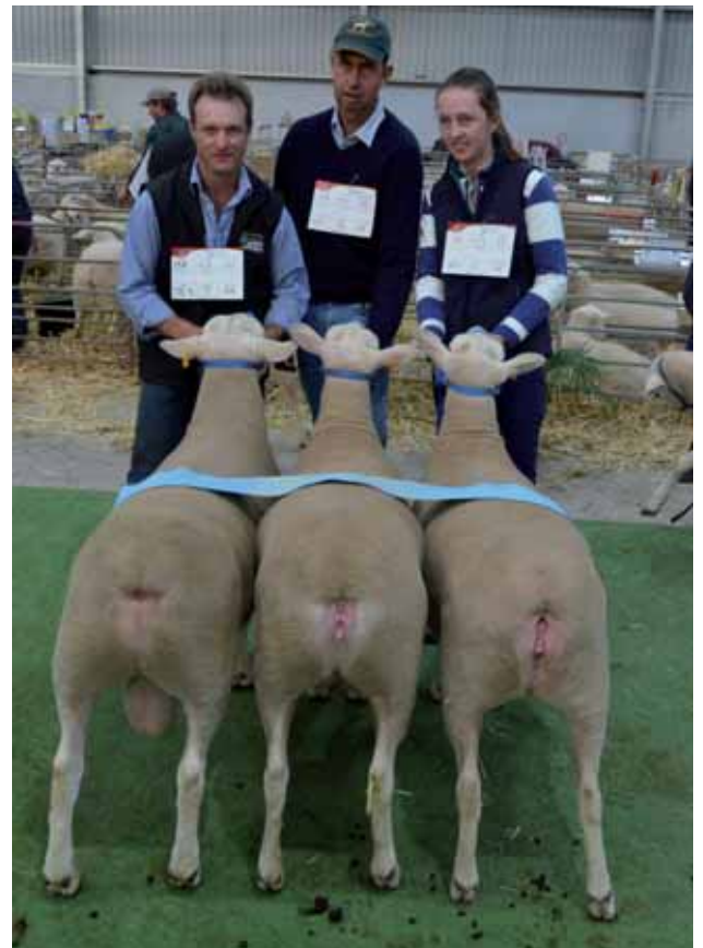
WINNING BREEDERS GROUP - ASHBANK