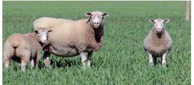
A crossbred ewe with her White Suffolk cross twin lambs on a grazing cereal crop

“Prime lambs are an important cash flow on mixed farms and demand will only grow from affluent economies wanting a protein source they enjoy consuming.”