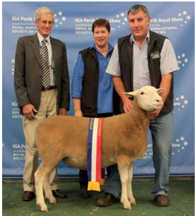
GRAND CHAMPION WHITE SUFFOLK EWE - BUNDARA DOWNS

RAM. Under 1½ years, not to show more than two permanent teeth, shorn, and to be Objectively Measured.