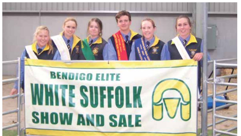
14 YEARS & OVER JUNIOR HANDLER COMPETITION