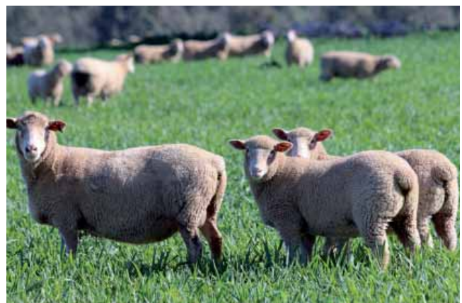
2013 drop stud rams at Glengarry White Suffolks have been DNA tested for meat eating quality traits

“We believe we now have a real maternal line in the breed.”