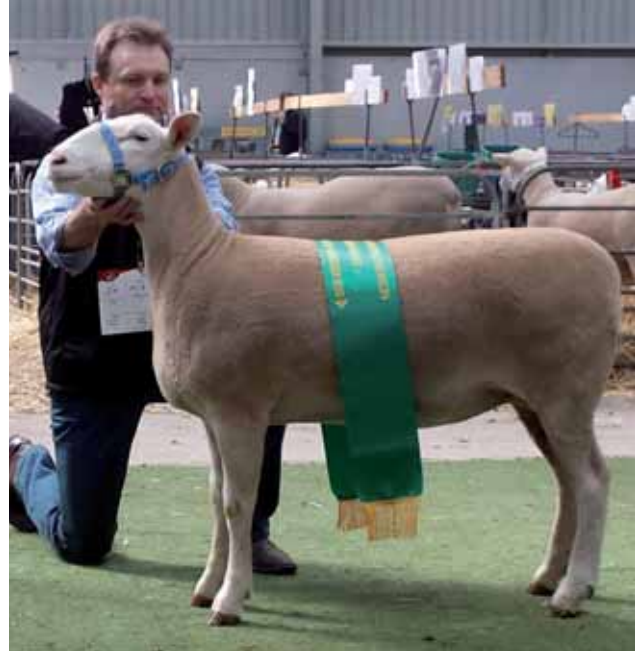
CHAMPION WHITE SUFFOLK EWE SENIOR CHAMPION WHITE SUFFOLK EWE - ASHBANK