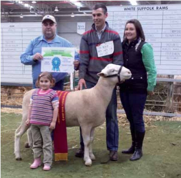
GRAND CHAMPION RAM & SUPREME CHAMPION EXHIBIT BOOLOOLA