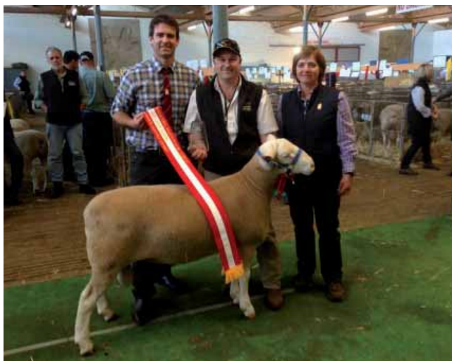
SENIOR CHAMPION, GRAND CHAMPION RAM & SUPREME WHITE SUFFOLK EXHIBIT - SUNNYBANKS