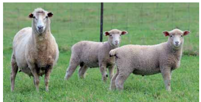
First cross ewes and White Suffolk cross lambs are used for student studies at the Riverina Institute of TAFE.

"We can always make money out of sheep – you can't turn the tap on a (dryland) crop if it doesn't rain."