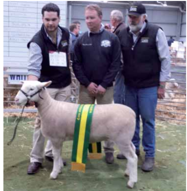
CHAMPION EWE -WINGAMIN