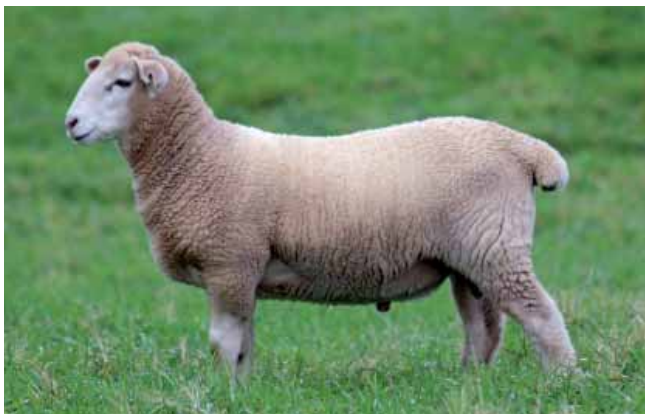
White Suffolk cross lambs have gained over 300 grams a day on the improved pastures at the Riverina Institute of TAFE.