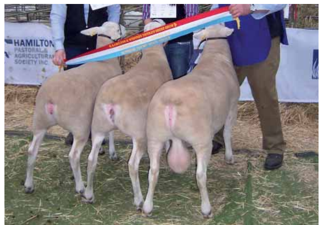
SUPREME CHAMPION SHORTWOOL GROUP - GLENARBIAN