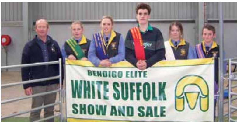
JUNIOR JUDGING COMPETITION