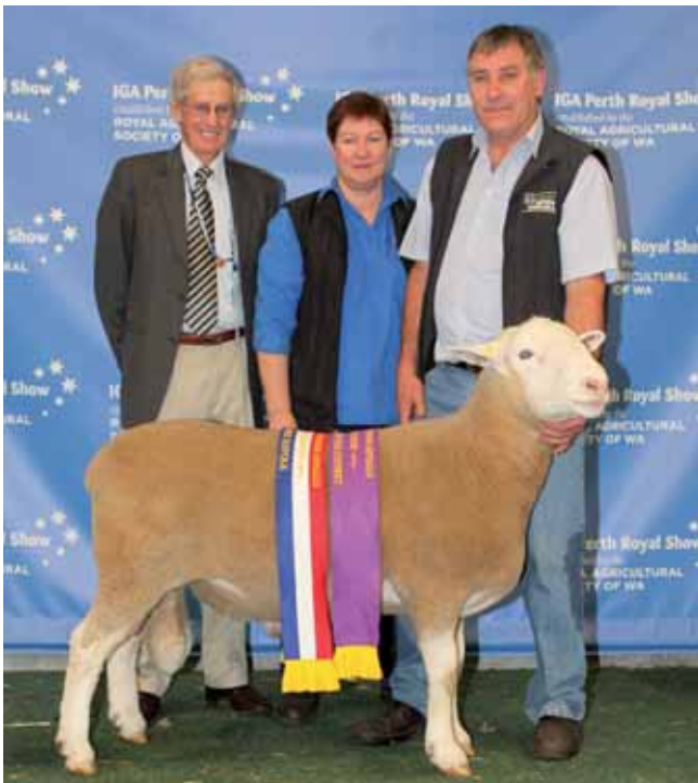
GRAND CHAMPION WHITE SUFFOLK RAM - BUNDARA DOWNS

JUDGE: DAWSON BRADFORD - EXHIBITORS: 13, SHEEP ENTRIES: 170