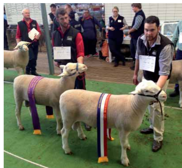
JUNIOR CHAMPION RAM - WINGAMIN RESERVE JUNIOR CHAMPION - BARINGA

RAM under 1.5 years. Born during the month of April, in the year prior to the Show