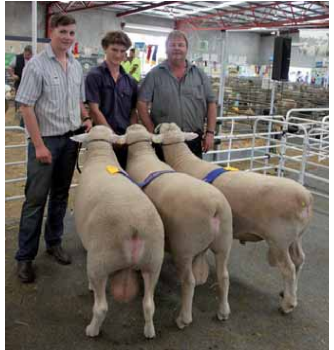
CHAMPION WHITE SUFFOLK GROUP OF THREE RAMS - IVESTON