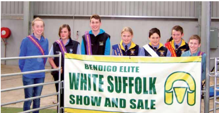
UNDER 14 YEARS JUNIOR HANDLER COMPETITION