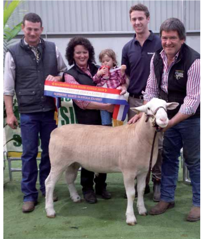
SUPREME CHAMPION WHITE SUFFOLK - ASHLEY PARK