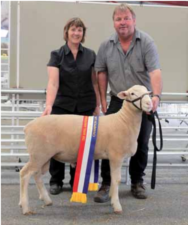
CHAMPION WHITE SUFFOLK LAMB -IVESTON

RAM LAMB. Autumn born on or after 1 April and before 31 May in the year of competition, shorn.